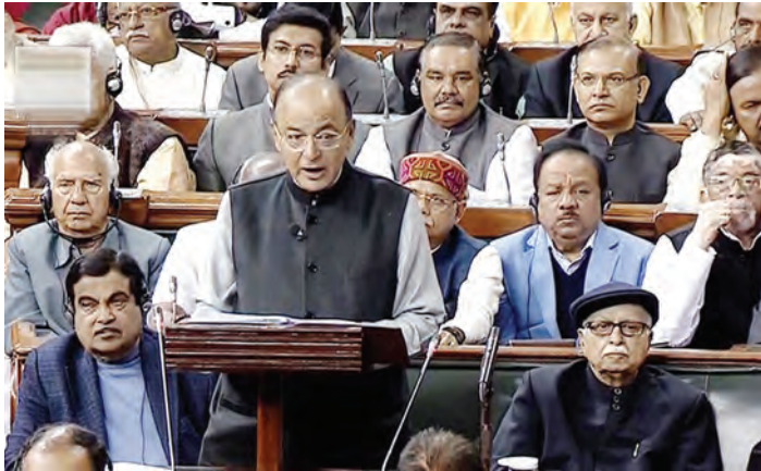
India's Finance Minister Arun Jaitley speaks on budget 2018, flanked by Nitin Gadkari on his right and nonagenarian Lal Krishna Advani on his left.

National Health Protection scheme announced