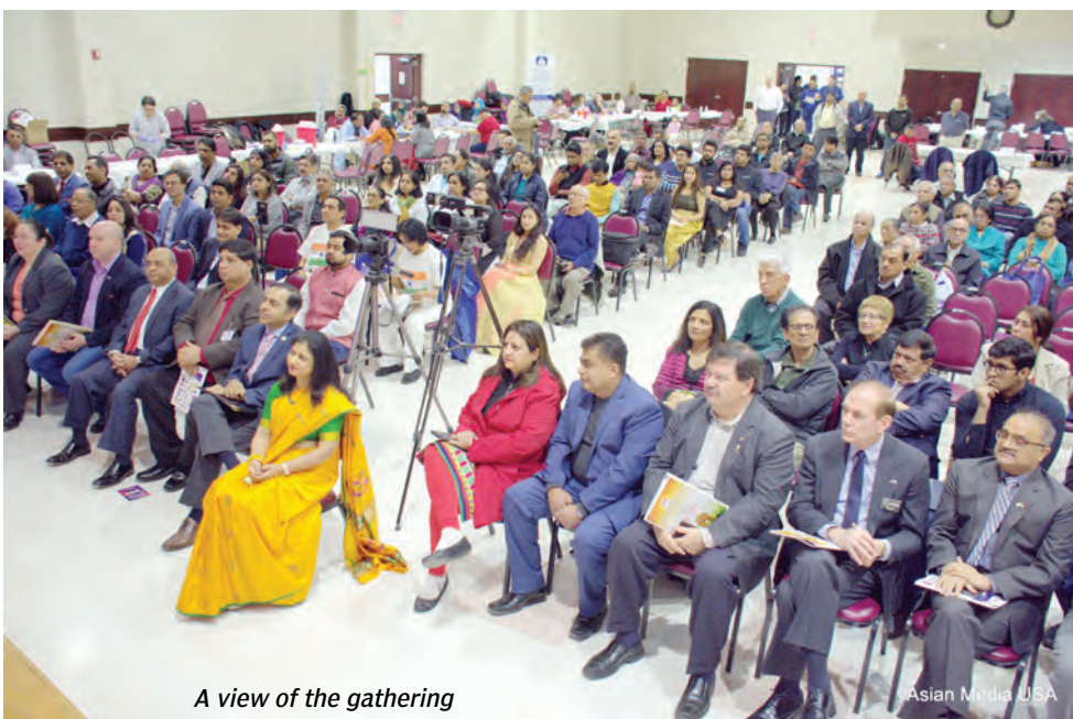
A view of the gathering

(PHOTOGRAPHS AND PRESS RELEASE BY: ASIAN MEDIA USA)