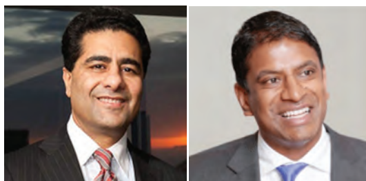
Two Indian American CEOs were among European Business Delegation Trump hosted to a dinner on the sidelines of the World Economic Forum

Trump thanked all the business leaders and urged them to invest in the US. The guests praised Trump for passing the GOP tax cut bill.