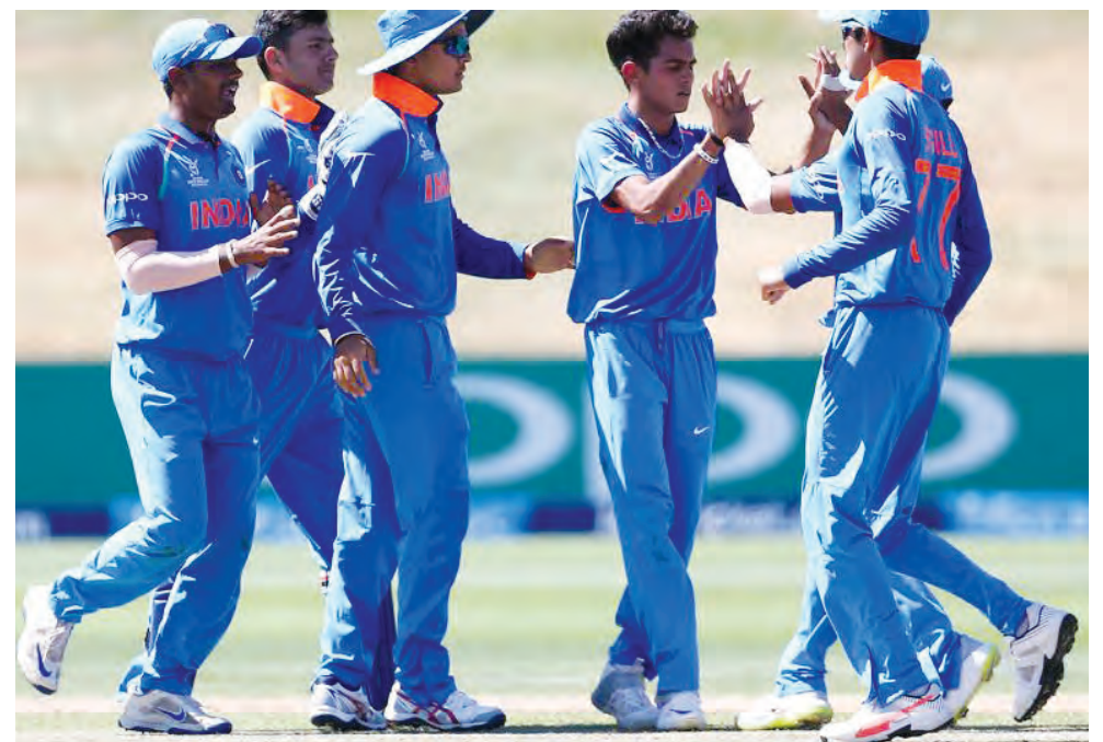
India, coached by Rahul Dravid, have been dominant on their way to the final of the ICC U-19 Cricket World Cup.

Chand's innings was the defining performance of the World Cup as it came in demanding conditions and against rivals who