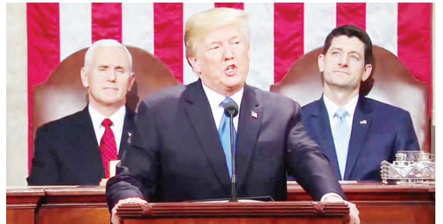
President Trump, in his first State of the Union address on January 30 night called for bipartisanship even as he pushed an agenda not to the liking of his political opponents. Seen behind the President are Vice President Mike Pence (left) and Speaker Paul Ryan (right).