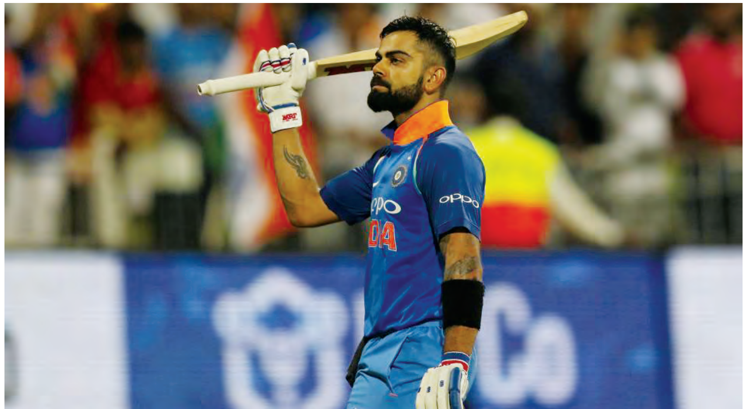
Indian cricket team captain Virat Kohli acknowledges the crowd after losing his wicket during the first ODI against South Africa at the Kingsmead Stadium in Durban on Thursday.

can go for six an over but they will pick you three wickets as well, which is eventually the difference in the game."