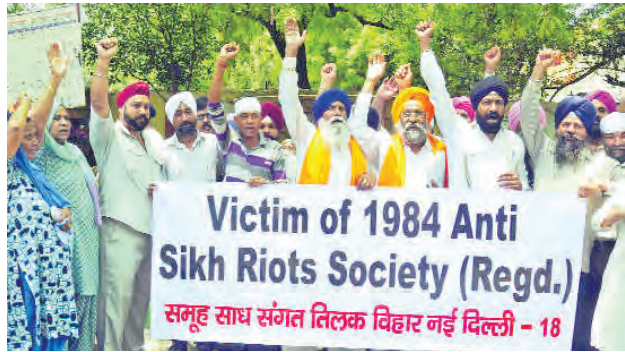
Anti Sikhs riots 1984 victims protest government apathy.

NEW DELHI (TIP): A modest Rs 10 crore has been earmarked for handing out enhanced compensation to victims of the 1984 anti-Sikh riots in the Budget 2018-19.