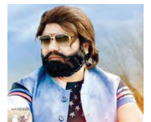
Gurmeet Ram Rahim Singh

The SIT members were not sure whether their testicles had been removed surgically or they had some problem. Their castration case was later handed over to the Central Bureau of Investigation.