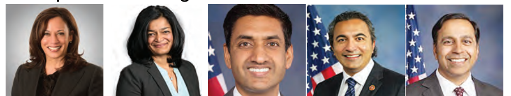
US Senator Kamala Harris and Representatives Pramila Jayapal, Ro Khanna, Ami Bera and Raja Krishnamoorthi have strongly criticized Trump's speech at the State of the Union address

WASHINGTON (TIP): All Indian Americans in Congress, much like their Democratic congressional colleagues, strongly criticized Trump's State of the Union address. Reiterating his position on immigration and young Dreamers, Trump said the $25 billion border wall that