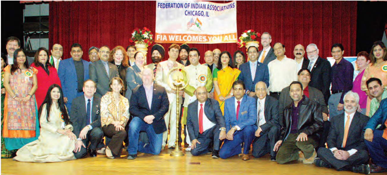
Dignitaries and the FIA Board members

CHICAGO, IL (TIP): The Federation of Indian Associations Chicago (FIA) celebrated India's 69th Republic Day by holding a Community Event at Shree Swaminarayan Temple, Itasca Illinois on Sunday, Jan 28, 2018. The event comprised of a blood Donation drive, a Health and Wellness Camp, Information on Medicare and Medicaid benefits, Information and advice on Taxation, College counselling, and Passport and Visa help.