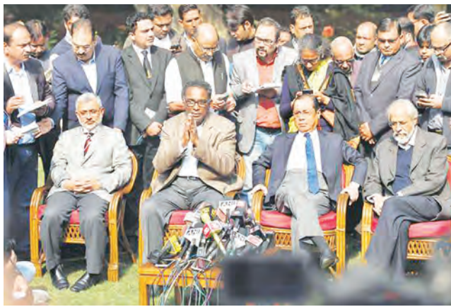
JUDGES' PLEA TO THE NATION: 'Please take care of the institution and take care of the nation.'

“As the four senior most judges of the Supreme Court flagged their concern about the institution, it was reminiscent of the Emergency. Most people are these days moving in hushed silence, stunned and traumatized by the goings-on.”