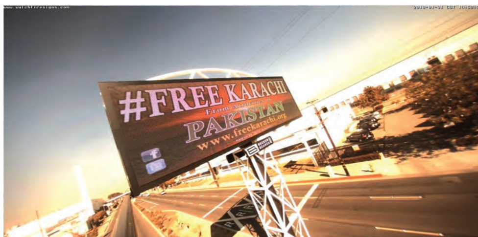
A billboard in Los Angeles