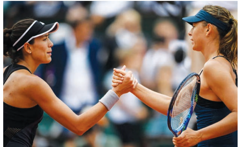
Garbine Muguruza (left) was far too strong for Maria Sharapova. Muguruza roared to a 6-2 6-1 victory.