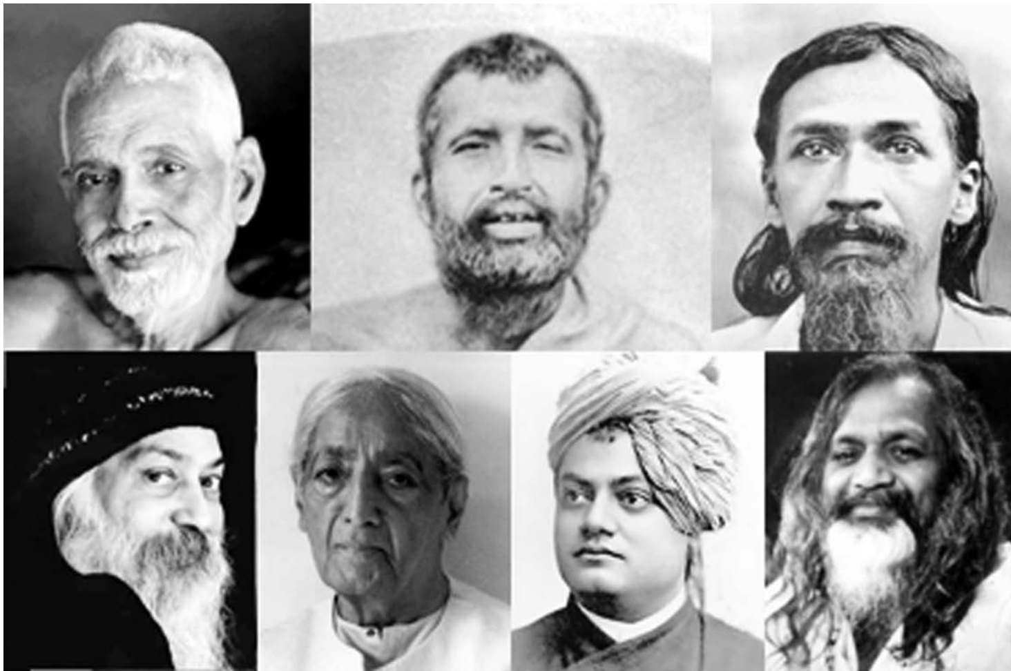
Great Spiritual Yoga Masters