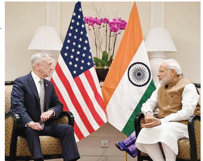
Prime Minister Narendra Modi with the U.S. Defense Secretary James Mattis in Singapore

The biggest challenges to a common India-U.S. vision are now emerging from the new U.S. law called Countering America's Adversaries Through Sanctions Act and the U.S.'s withdrawal from the Iran nuclear deal