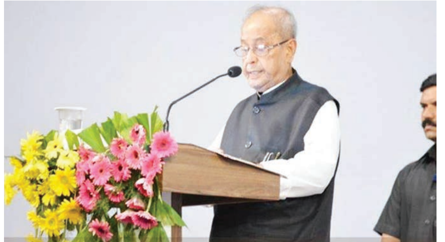
Pranab Mukherjee said the soul of India resides in pluralism and tolerance