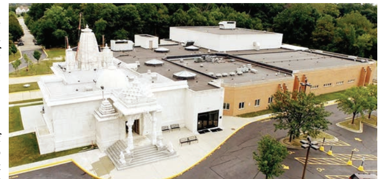
The Jain Temple

The ten-day celebration includes various religious, cultural, educational and entertainment events to keep the audience enthralled. There is also a separate track of activities for youth and young adults. Planning for the celebration has been going on for the last 6 months and has now reached a feverish pace with over 200 volunteers working to put finishing touches with the Executive Committee and Board of Trustees leadership.