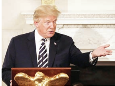
Donald Trump said he will 'fight' at the G7 Summit 2018.

The two-day meeting will be dominated by the possibility of a trade war - prompted by the US levies of 25 per cent on steel and 10 per cent on aluminum