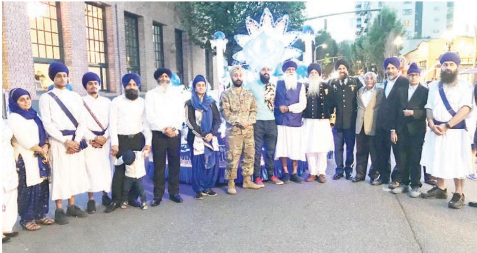
Sikh community created a float in honor of Sikhs in Service

PORTLAND, OREGON (TIP): This past Memorial Day Weekend several Sikh organizations including Sikh American Legal Defense and Education Fund, Sikh Seva Foundation, Ghadar Memorial Foundation, SAVA, and SikhLens, along with the local Sikh community organized a program in celebration of Dr. Bhagat Singh Thind's service and activism.