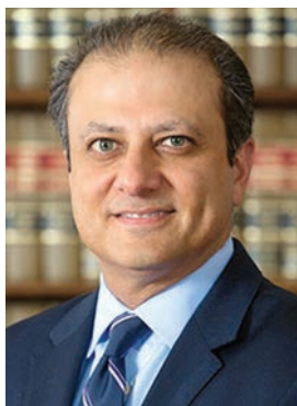
Speculation is rife that Preet Bharara may be eyeing the post of AG of NY State

NEW YORK (TIP): Preet Bharara, the former United States attorney in Manhattan who was fired by President Trump, has registered as a Democratic voter in New York for the first time in more than a decade amid speculation that he might run for