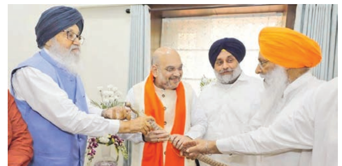
BJP chief Amit Shah met Akali Dal patriarch Parkash Singh Badal and his son president Sukhbir Badal in Chandigarh.

It's a different matter though that Shiv Sena ultimately supported NDA candidate Ram Nath Kovind in the 2017 Presidential Election.