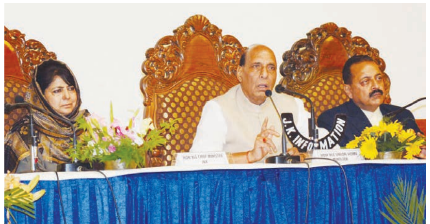
Union Home Minister Rajnath Singh addressing a press conference in Srinagar, Jammu & Kashmir on June 7, 2018. Chief Minister of Jammu and Kashmir Mehbooba Mufti and the Minister of State for Development of North Eastern Region (I/C), Prime Minister's Office Jitendra Singh are also seen.

At the same event, Chief Minister of Jammu and Kashmir Mehbooba Mufti said children from Jammu and Kashmir