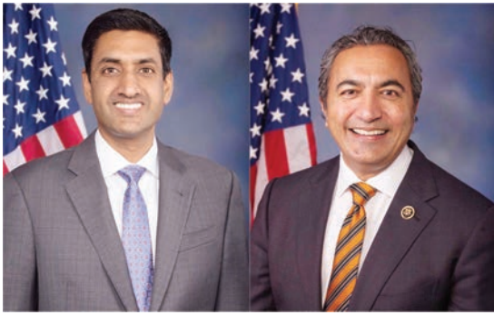
Democratic US Representative Ami Bera (left) and California Democrat Ro Khanna.

SACRAMENTO, CA(TIP): Indian American Democrats Ami Bera and Ro Khanna have won their primaries in their bid to hold on to their congressional seats in California.