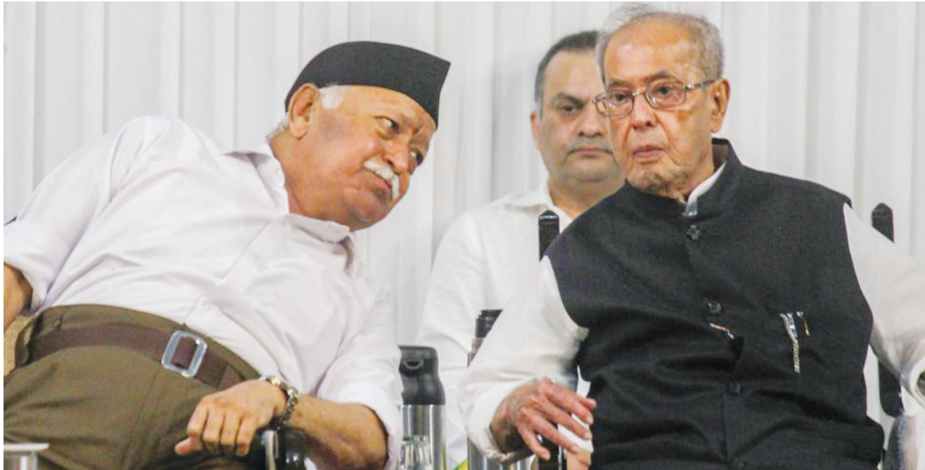
Former president Pranab Mukherjee with Rashtriya Swayamsevak Sangh (RSS) chief Mohan Bhagwat at the closing ceremony of 'Tritiya Varsha Sangh Shiksha Varg', in Nagpur on June 7.

NEW DELHI (TIP): The much-hyped visit of former president Pranab Mukherjee, which had created equal and heightened anxiousness among the BJP and Congress camps, ended in pleasing both.