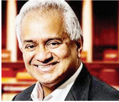
Tommy Thomas has been a lawyer in Malaysia for 42 years

The appointment of Mr. Thomas as the top legal officer would not affect the special rights and privileges of the Malays and Bumiputeras, as well as the