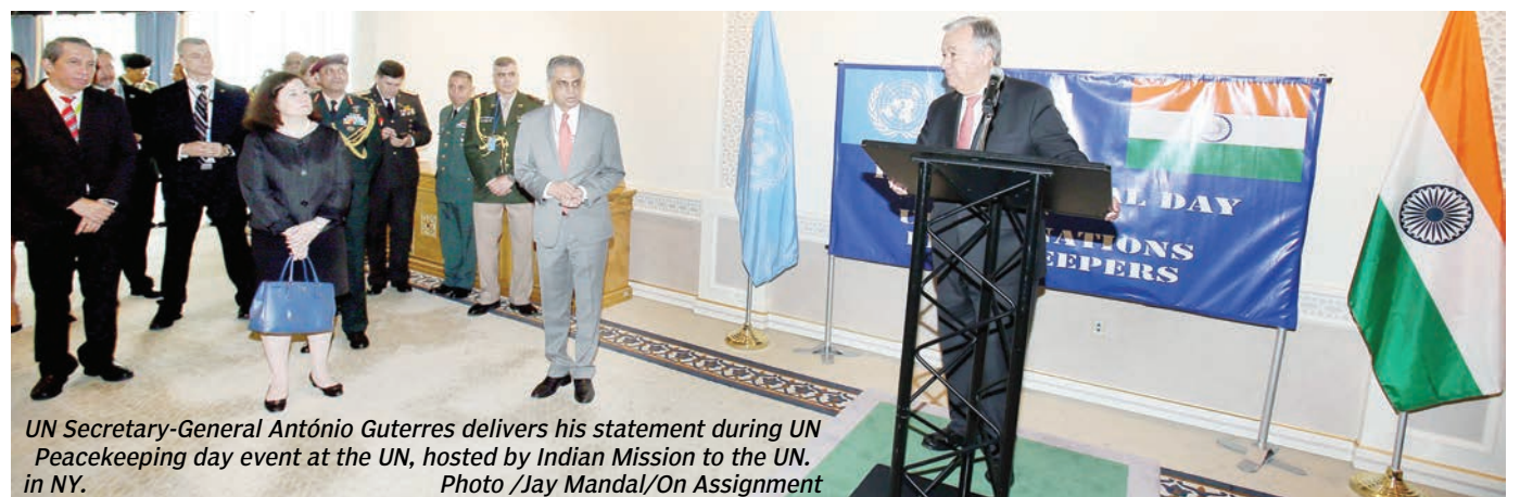
UN Secretary-General António Guterres delivers his statement during UN Peacekeeping day event at the UN, hosted by Indian Mission to the UN. in NY.