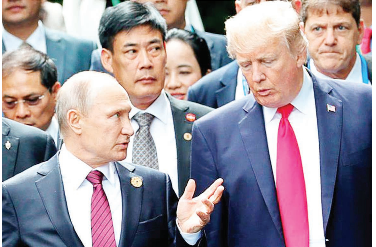
U.S. President Donald Trump (right) and Russian President Vladimir Putin (left) in Helsinki, Finland, on July 16, 2018

President Donald Trump has already committed crimes that are impeachable under the U.S. Constitution. Apolitical Americans are demanding that he be impeached right away. Are there Republicans with spine in U.S. Congress who will initiate the process of impeachment without wasting any more time? They don't have to wait until special counsel Robert S. Mueller III completes his investigation into Russia's meddling in the 2016 presidential election and into the alleged collusion between the Trump campaign and Russia during that election.