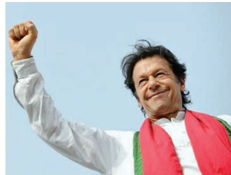
Imran Khan is the first sportsperson to have been chosen to lead a country

“Barring a few exceptions, they were all introduced on the political horizon as "bold and big game-changers". Finding their wings clipped and sans all powers, they attempted to walk free, only to end up as "loners" and "failures". What they did on playfields, they could not repeat even one per cent of that in politics. It is all the more intriguing that Indian sports is mired much deeper in politics than the politics of running the world's biggest liberal democracy. But our sports personalities have failed on that front, too", says the author.