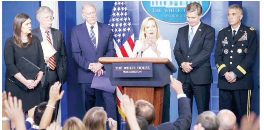
Director of National Intelligence Dan Coats, National Security Adviser John Bolton, DHS Secretary Nielsen and FBI Director Chris Wray each took turns describing how each of their agencies is working to combat the threat.

WASHINGTON (TIP): A number of top intelligence community officials gathered, August 2, at White House briefing to discuss U.S. efforts going forward to combat election interference attempts. White House press secretary Sarah Huckabee Sanders was joined by FBI Director Christopher Wray, Director of Homeland Security Kirstjen Nielsen, Director of National Intelligence Dan Coats, National Security Advisor John Bolton, and National Security Agency Director Gen. Paul Nakasone. contd on Page 20