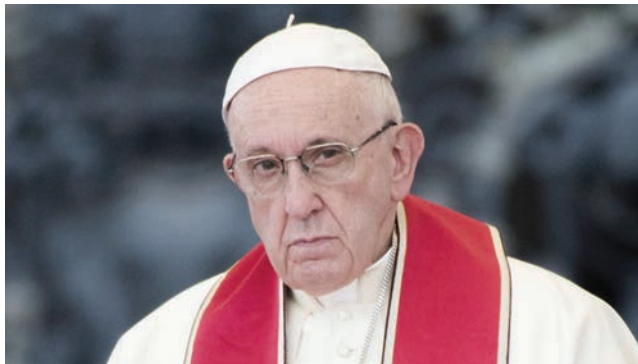
Pope rejected death penalty and said, "Let us take responsibility for the past and recognize that the imposition of the death penalty was dictated by a mentality more legalistic than Christian."