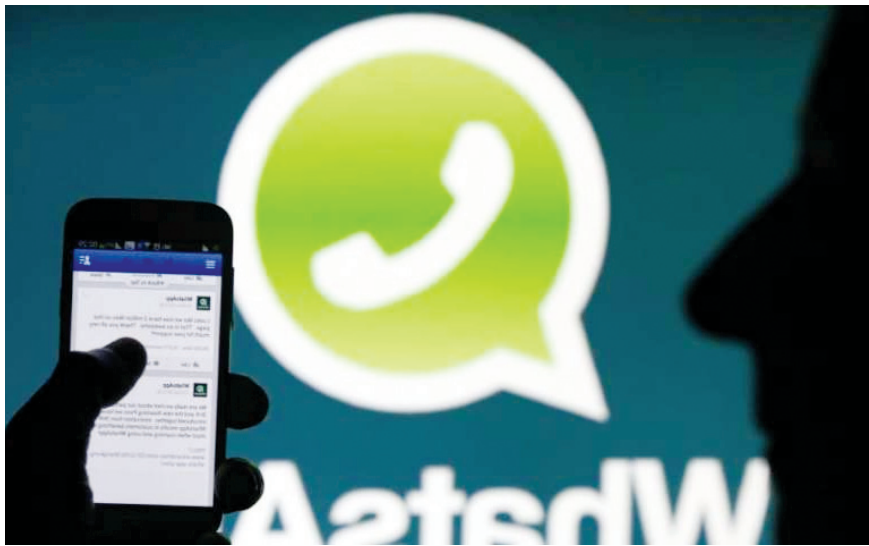
Facebook said it has been testing a 'WhatsApp Business' tool for months with more than 90 companies including Uber and Singapore Airlines

Facebook has long been testing ways to make money from WhatsApp, which it bought in early 2014 in a deal valued at $19 billion.