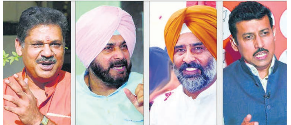
Sports stars-turned politicians: Kirti Azad, Navjot S Sidhu, Pargat Singh, Rajyavardhan S Rathore.

parties or as independents. Kirti Azad (BJP) is a senior politician. His long innings in cricket and then in politics almost brought him to the brink for alleging wrongdoings in the DDCA.