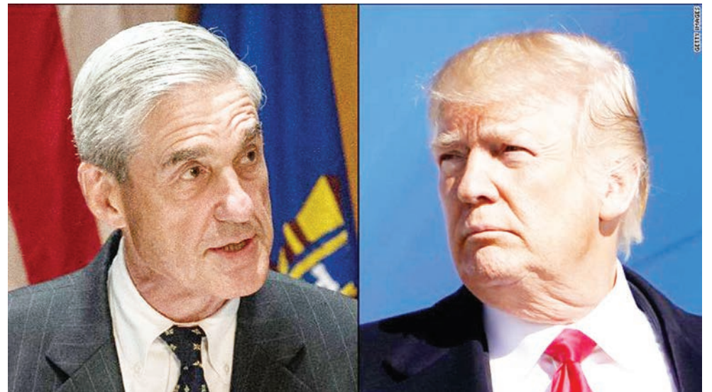
Special Counsel Robert Mueller's team has offered the White House format changes, according to sources

Mr. Trump has raged privately in recent days that both the forces of government and