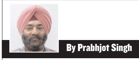
By Prabhjot Singh

Politics in sports and sportspersons in politics are two diverse, interesting and highly debatable issues. The emergence of former Test cricketer Imran Khan on the global political scenario has again activated an animated discussion on whether sportspersons make better politicians or not. Never before in the world has a Test cricketer been chosen to lead a country tormented by internal strife, economic turndown, corruption and armed conflict.