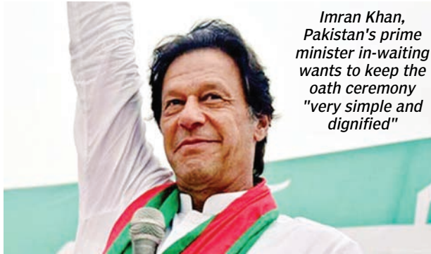
Imran Khan, Pakistan's prime minister in-waiting wants to keep the oath ceremony "very simple and dignified"

ISLAMABAD (TIP): A Pakistan Foreign Office spokesman, on Thursday, August 2, said that no foreign leader will be invited to the oath-taking ceremony of Imran Khan, as the prime minister in-waiting wants to keep the event very simple and dignified. contd on Page 20