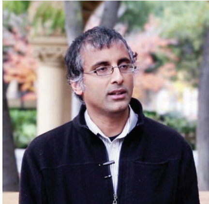
Akshay Venkatesh, 36, currently teaching at Stanford University, has won the Fields Medal for his "profound contributions to an exceptionally broad range of subjects in mathematics."

The prize was inaugurated in 1932 at the request of Canadian mathematician John Charles Fields, who ran the 1924