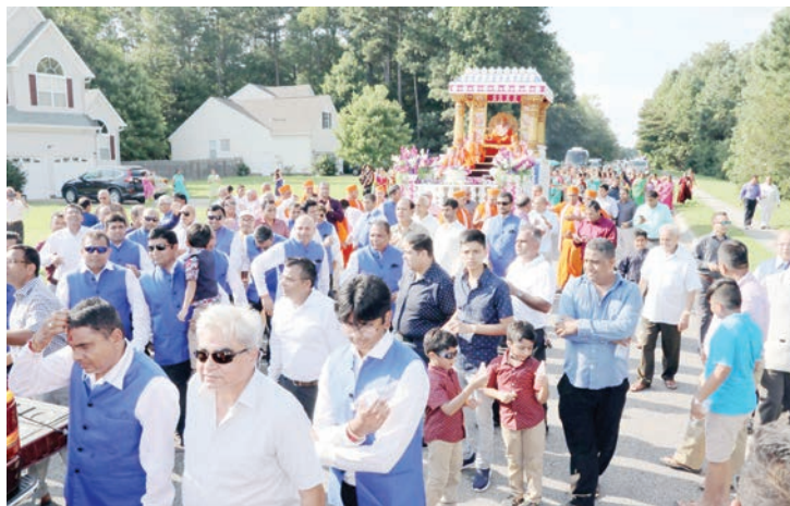
The Peace Parade