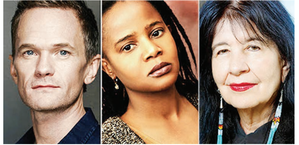
Neil Patrick Harris, Edwidge Danticat, Joy Harjo

author events will be free to the public, though registration will be required. Subscribe here for email updates on ticketing and book sales, which will be announced in August. More information will be available at loc.gov .