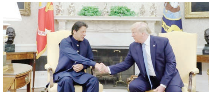
U.S. President Donald J. Trump shakes hands with Pakistan's Prime Minister Imran Khan at the start of their meeting in the Oval Office of the White House in Washington on July 22, 2019