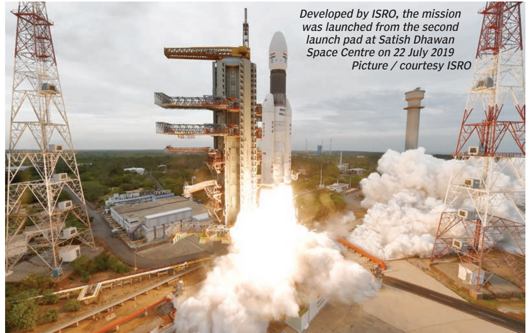
Developed by ISRO, the mission was launched from the second launch pad at Satish Dhawan Space Centre on 22 July 2019.