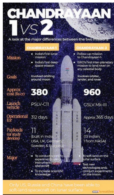
A look at major differences between Chandrayaan-1 which was launched by ISRO in October 2008 and Chandrayaan 2 launched on 22 July 2019

Former Prime minister Atal Behari Vajpayee announced the Chandrayaan project on course in his Independence Day speech on 15 August 2008. The mission was a major boost to India's space program. The idea of an Indian scientific mission to the Moon was first mooted in 1999 during a meeting of the Indian Academy of Sciences. The Astronautical Society of India (AeSI) carried forward the idea in 2000. Soon after, the Indian Space Research Organization (ISRO) set up the National Lunar Mission Task Force, which concluded that ISRO has the technical expertise to carry out an Indian mission to the Moon. In April 2003 over 100 eminent Indian scientists in the fields of planetary and space sciences, Earth sciences, physics, chemistry, astronomy, astrophysics and engineering and communication sciences discussed and approved the Task Force recommendation to launch an Indian probe to the Moon. Six months later, in November, the Indian government gave the nod for the mission.