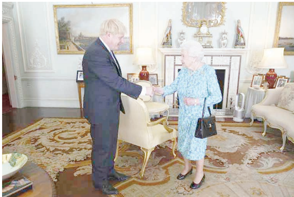
Britains Queen Elizabeth II welcomes newly elected leader of the Conservative party Boris Johnson during an audience at Buckingham Palace, London, on Wednesday.