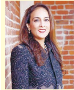
The Chandigarh-born Republican activist and leading campaign ethics lawyer is among seven women named as co-chairs of the newly formed Women for Trump Coalition

WASHINGTON (TIP): California lawyer Harmeet Dhillon has been named a co-chair of the "Women for Trump 2020" campaign coalition.