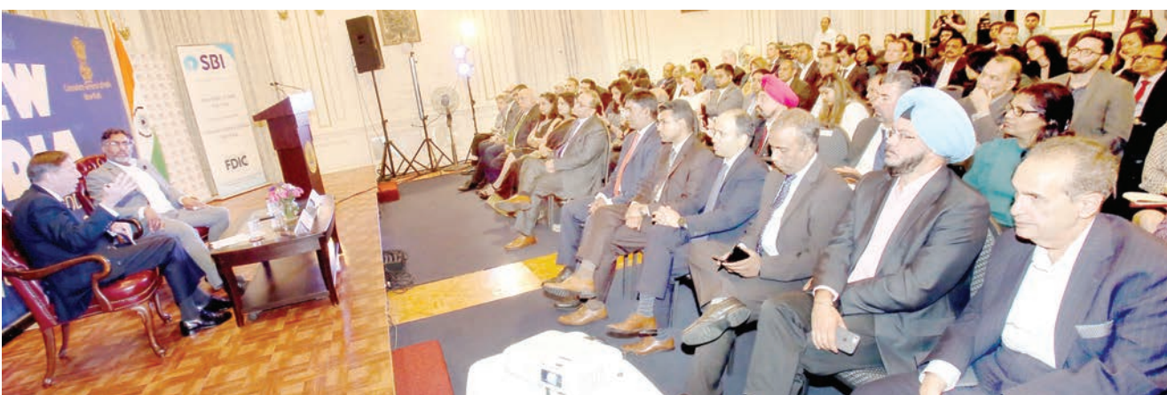
A view of the audience