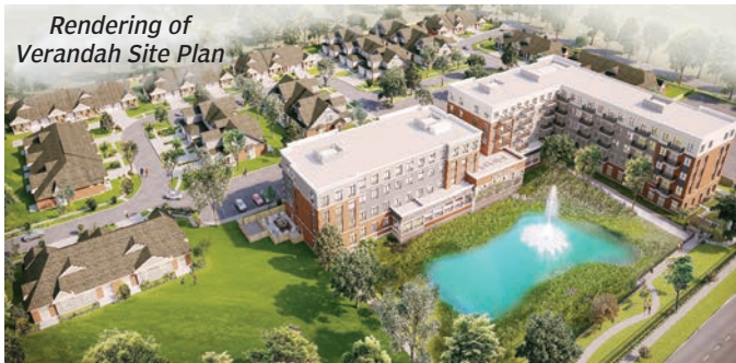
Rendering of Verandah Site Plan