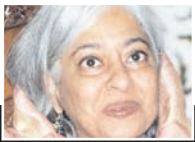
By Radha Kumar

The national bar against hate crime has been lowered, but resolute corrective action is possible