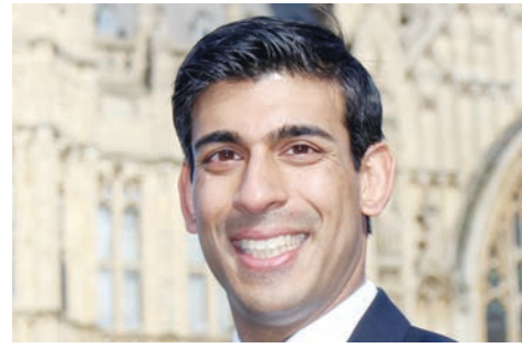
Johnson named Priti Patel as Home Secretary, Alok Sharma as the International Development Secretary and Rishi Sunak as the Chief Secretary to the Treasury

LONDON / NEW YORK (TIP): New British Prime Minister Boris Johnson has appointed three Indian-origin leaders in his top ministerial team.